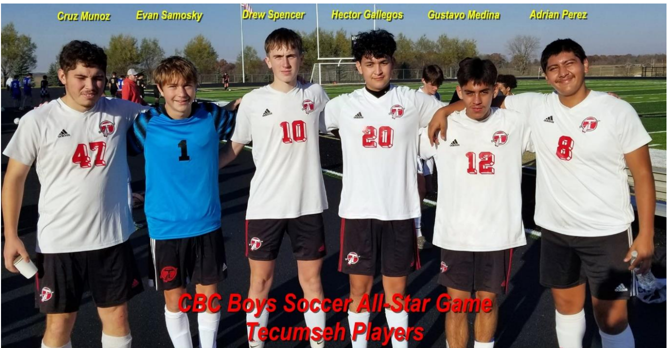
All-Star Team 2023 CBC Boys Soccer